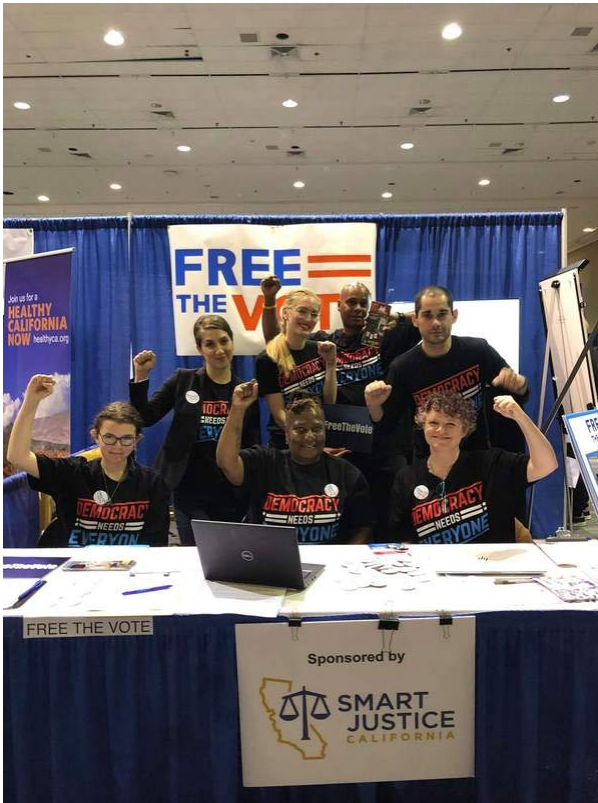
Free the Vote CA coalition members ready to rock the Moscone Convention Center in San Francisco on June 1, 2019.