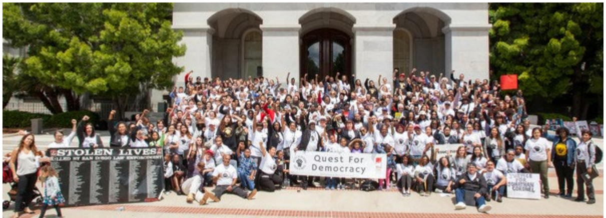
Quest for Democracy participants on the Capitol South Steps, Sacramento, CA, May 20, 2019.